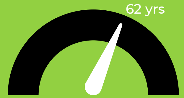
Ava. Age Claiming Social Security

60 years of age is the perfect time to begin mapping out the proper strategy for the third stage of your life.